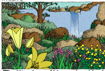
The Kingdom of Heaven Is at Hand.

Saint John the Baptist appears on the scene today as Advent enters its second week. The mysterious consumer of locusts and wild honey, John echoes the words of the prophet Isaiah as he calls for repentance in the face of the nearness of the kingdom of heaven. The rhythms of the Christian life are often confounding. Each year we meet the Baptist and hear his calls for repentance. Each year we see him pointing to the one who is coming after him, the Lord Jesus. Yet each year the words and actions of John the Baptist echo anew in our hearts, because we have fallen into old sinful traps again and again. Advent gives us the opportunity once again to turn away from our sinful ways and embrace the gospel way of life. John the Baptist invites us to prepare the way for the Lord, in whom we place our hope.